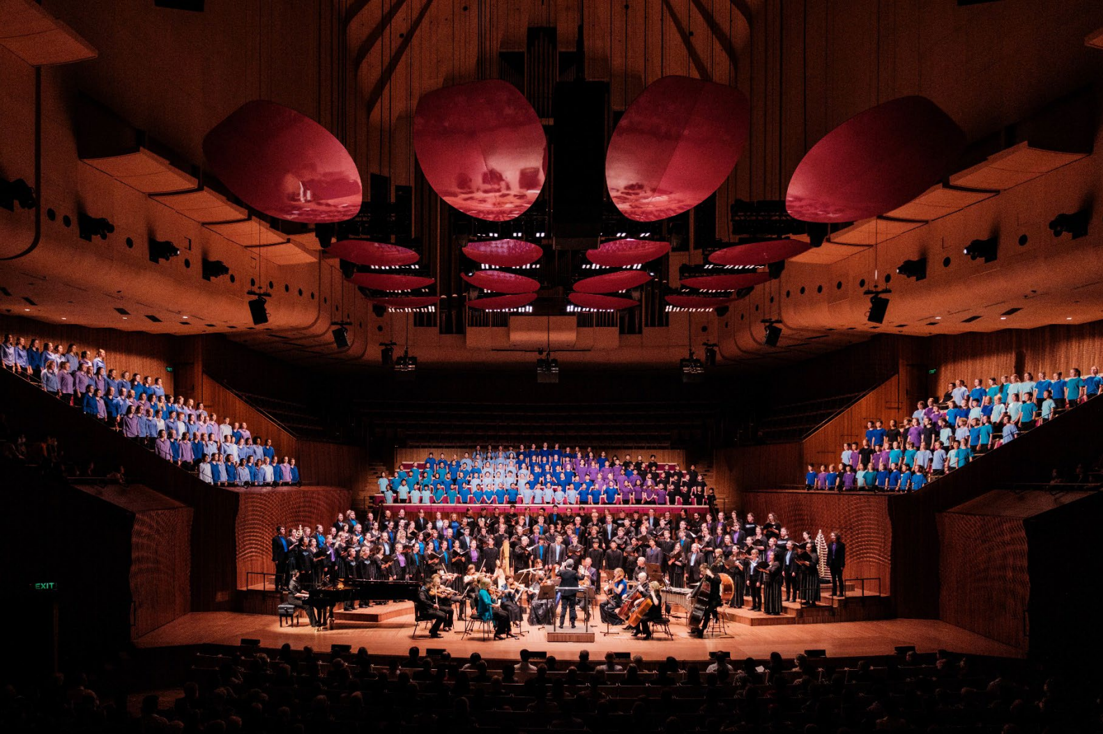
Voices of Angels 2022