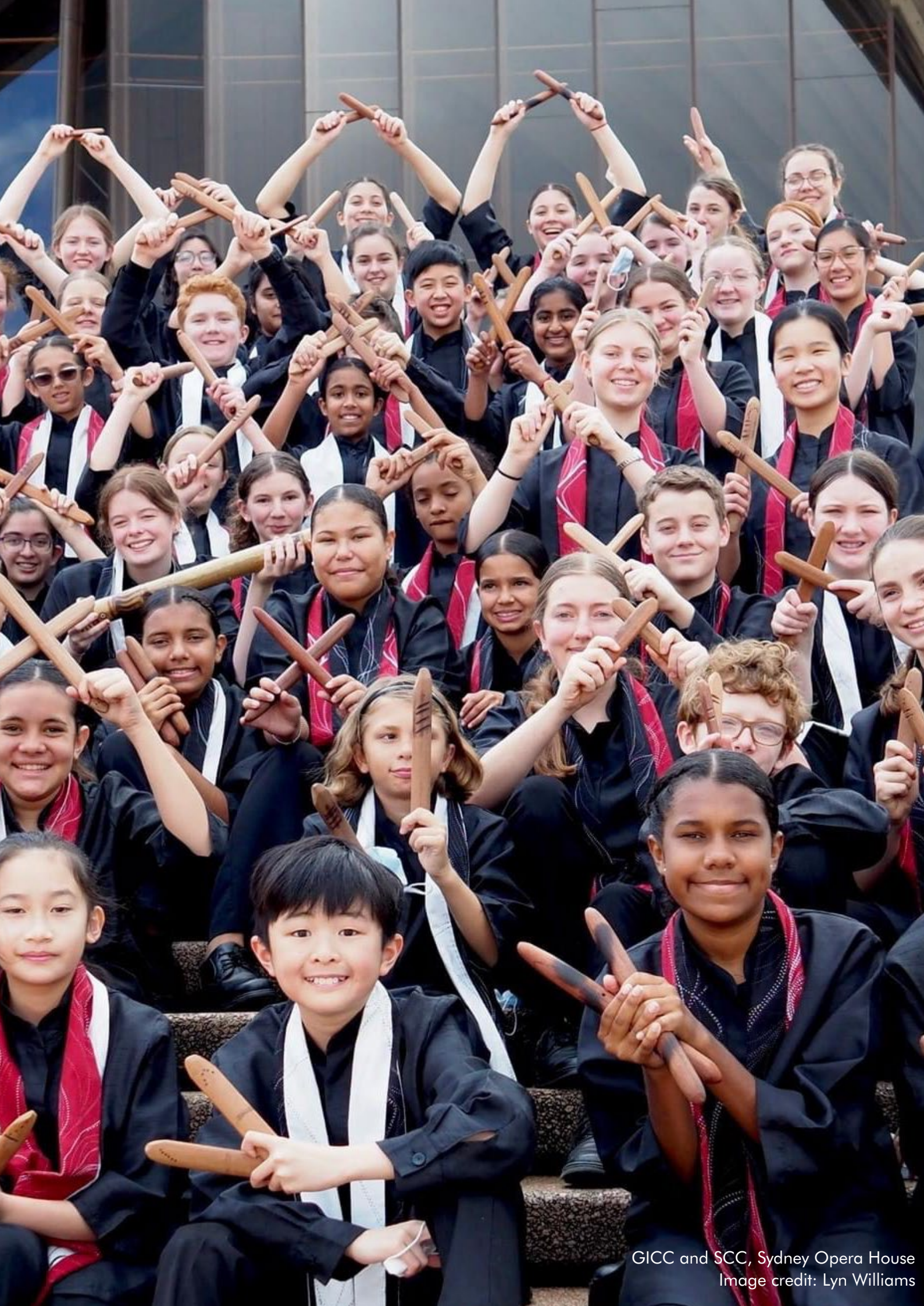
GICC and SCC, Sydney Opera House