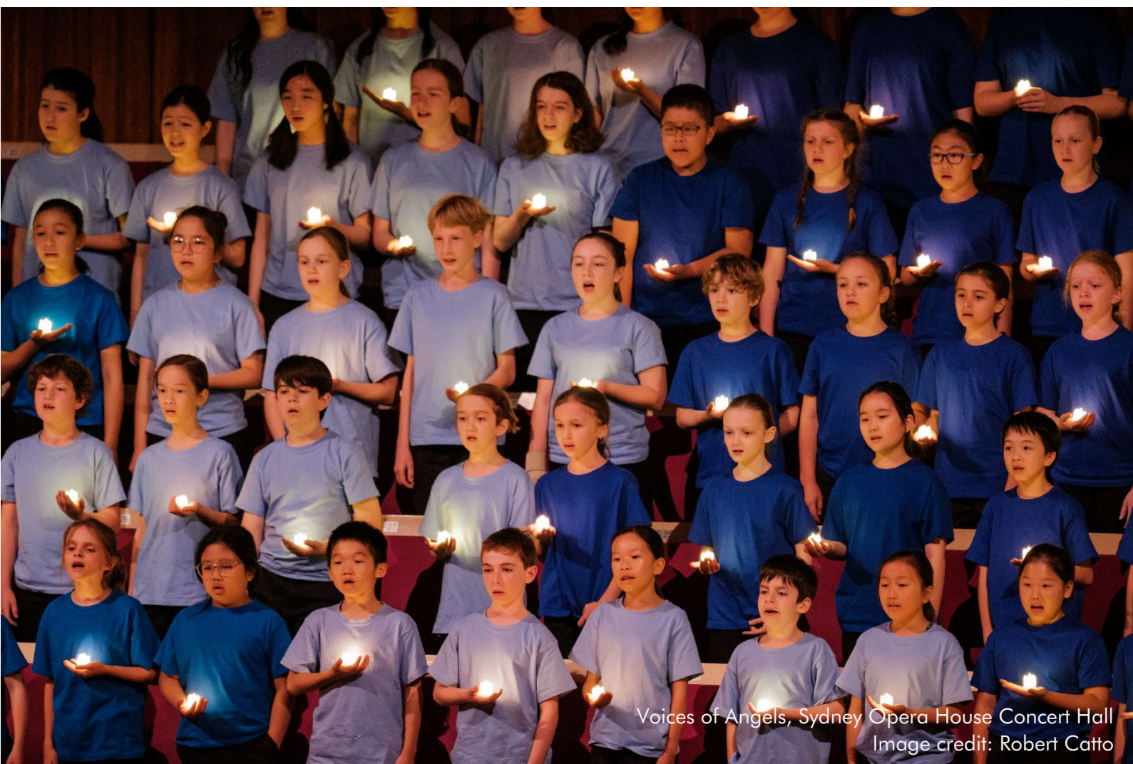
Voices of Angels, Sydney Opera House Concert Hall