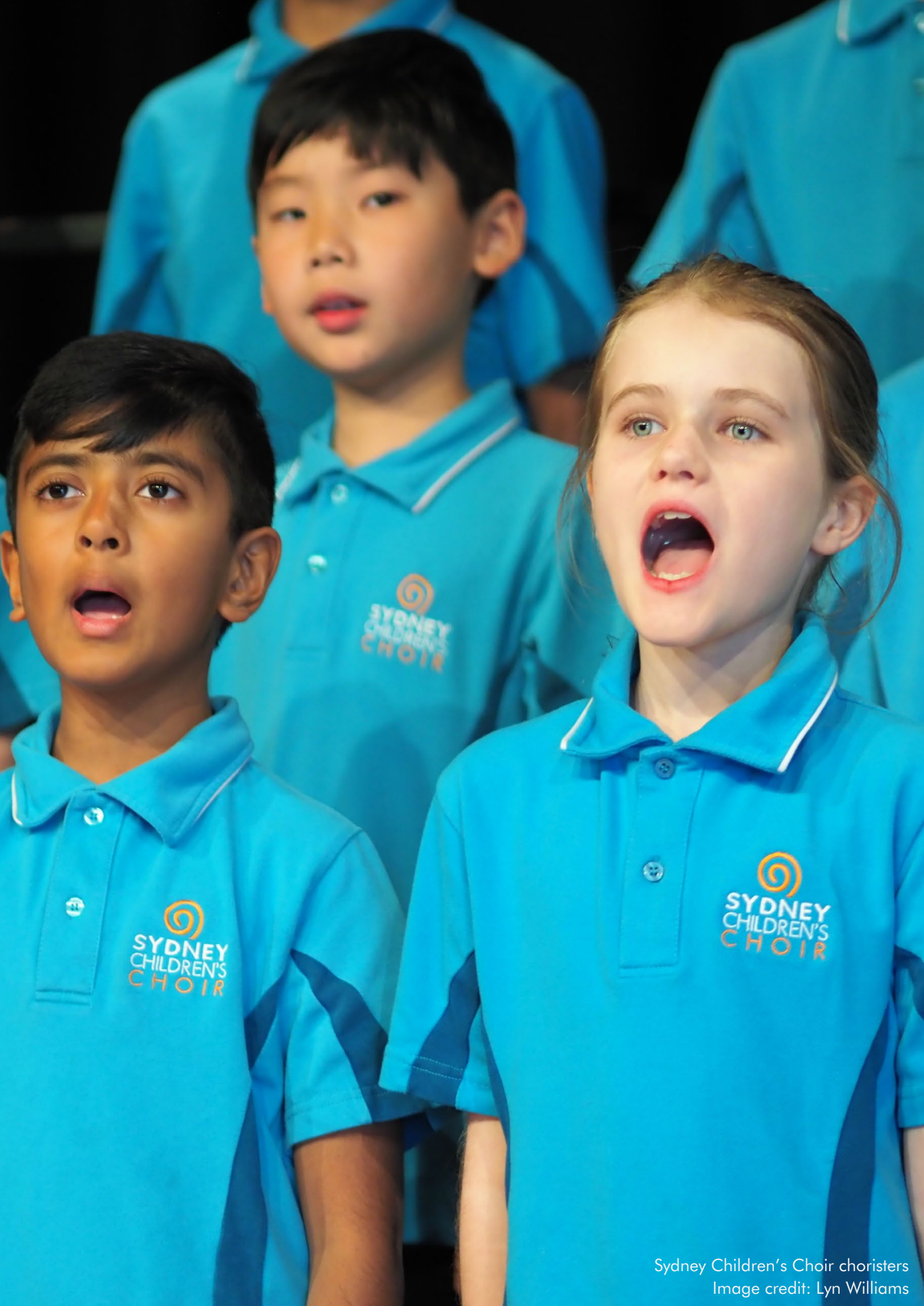
Sydney Children's Choir choristers